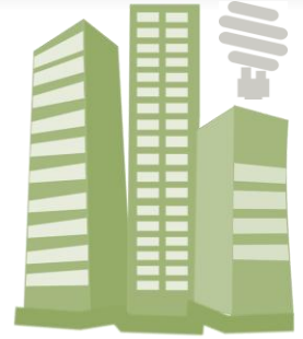
Electricity Demand in Canada by Sector, 2013*

The energy use is divided between what is referred to as 'base building operation' – the energy consumed by equipment that helps a building run. The remaining portion of energy used is associated with tenant use, such as electricity for lighting, computers, office equipment and kitchen appliances.